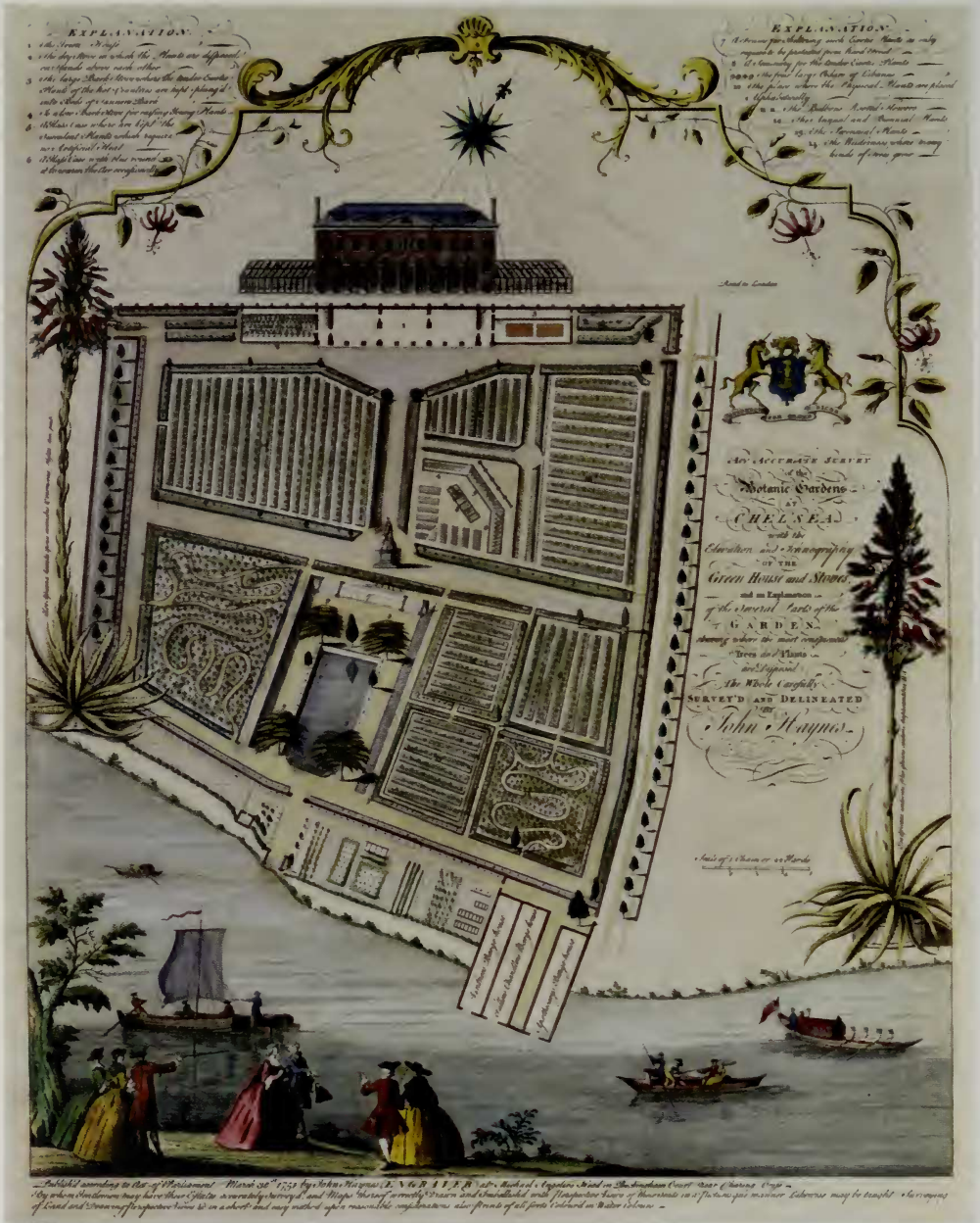
Figure 4.- Map of the Chelsea Physic Garden made by John Haynes (ca. 1706-ca. 1770) in 1751. Notice the statue of Sir Hans Sloane located in the center of the garden (see Figure 5).

In previous studies we have shown that, besides Clifford's Hartekamp Gardens, several other European gardens grew plants from the Macaronesian Islands before 1753 (SANTOS-GUERRA [72]; FRANCISCO-ORTEGA et al. [27-28]). Among them there were the Chelsea Physic Garden (located in London) and the Botanic Garden of Amsterdam (also cur-